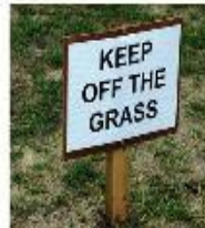
Keep off the grass