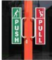
Push to open