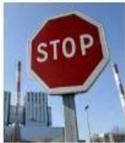
Stop at the junction

The Imperative form is used to give orders or instructions, make a request, invitation or offer advice - we usually find them on notices, signs, in recipes and elsewhere. The implied subject in imperatives is the second person (you).