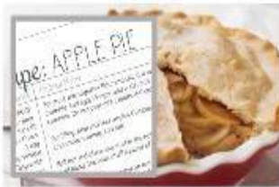
Chop the apples Add a teaspoon of cinnamon Mix well