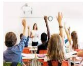
Open your books Sit down Don't talk