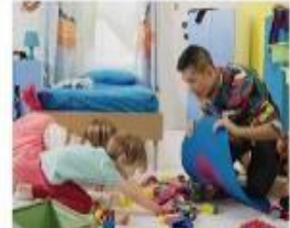
Tidy your room