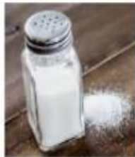
Pass the salt